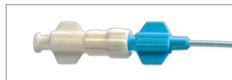
Flow-Thru Hub with self-adjusting occluding wire

Catheter directed thrombolysis offers many advantages over alternative therapies and is a viable option for managing thrombus. Other mechanical methods have been developed but at great cost and with possible complications such as bradyarrhythmias and hemolysis. 9 The Uni-Fuse catheter is a cost effective and proven method of managing patients presenting with thrombus.