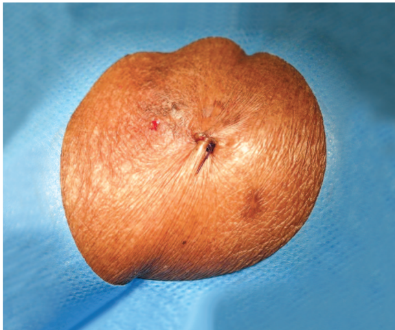
Suture tied without button.