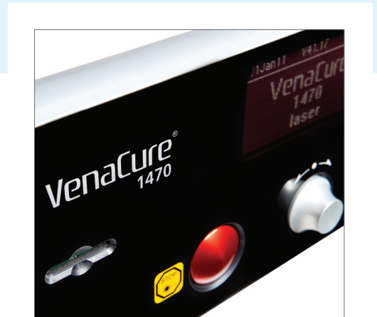
Heats the Vein Wall to Ablation Temperature Faster

AngioDynamics is one of the few vein treatment companies to manufacture the laser and fiber components. The VenaCure 1470 nm laser is hand-crafted in AngioDynamics' manufacturing facility. Our proven track record of reliability allows us to offer an industry-leading 3-year warranty to ensure the highest quality laser and service. Every laser endures a rigorous testing process throughout assembly and upon completion. Ablate veins with the confidence that AngioDynamics' equipment is the highest quality available on the market.