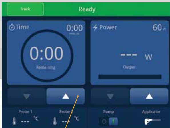
Simple Operating Parameters of Time and Wattage